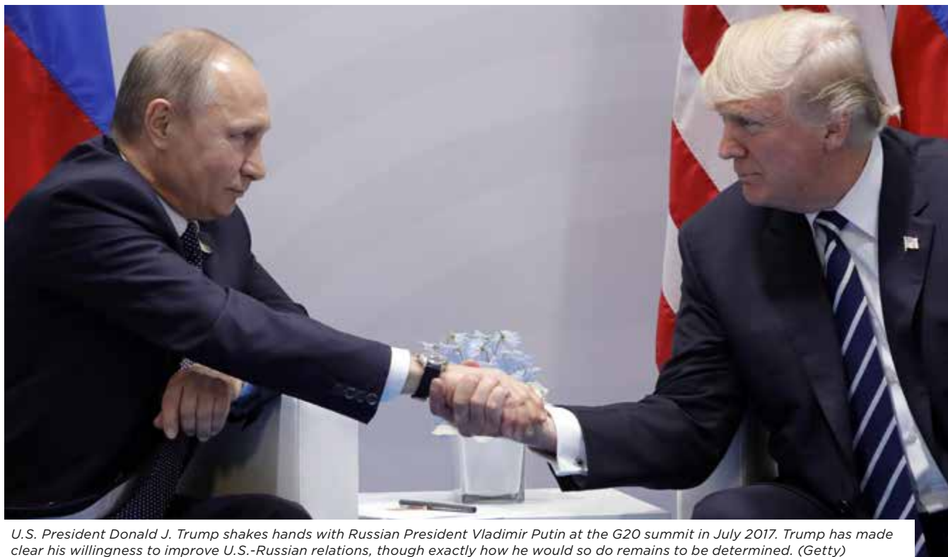
U.S. President Donald J. Trump shakes hands with Russian President Vladimir Putin at the G20 summit in July 2017. Trump has made clear his willingness to improve U.S.-Russian relations, though exactly how he would do so remains to be determined.

Even as various developments have heightened tensions between the United States and Russia, fundamental changes in the military-technological landscape are offering both sides new opportunities for advancing military capabilities – while also posing