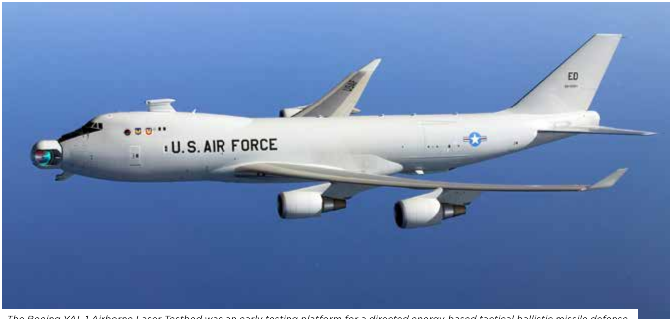
The Boeing YAL-1 Airborne Laser Testbed was an early testing platform for a directed energy-based tactical ballistic missile defense system. The advent of sustainable and survivable directed-energy ballistic missile defenses could complicate strategic stability.

How Changing Geopolitics and Emerging Technologies are Reshaping Pathways to Crisis and Conflict