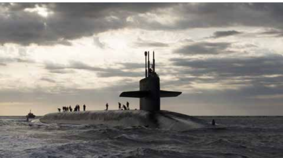
The sea leg of the U.S. nuclear triad is made up of ballistic missile submarines (SSBNs) like the USS Rhode Island (SSBN-740). The United States depends on the survivability of these assets to assure its nuclear second-strike capability.

Ultimately, it is exceptionally difficult to assess the plausibility of strategic antisubmarine warfare and the ability to target mobile ICBMs in an unclassified paper. The revealed preferences of the two states, however, are highly suggestive about their assessments of how manageable the threats to strategic missile submarines and mobile ICBMs are. The United States is proceeding with its Columbia -class replacement SSBN, which will continue to serve as the backbone of the U.S. strategic deterrent, indicating that the United States does not regard threats to its strategic missile submarines in the coming generation as unmanageable. 82 Meanwhile, Russia is continuing to develop and deploy both new SSBNs and mobile ICBMs, indicating that it also views threats to such systems