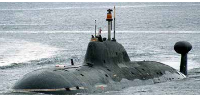
Russian Akula cruise missile-capable submarines have been seen off the East Coast of the United States. (Ilya Kurganov)

substantial cruise missile attack on leadership early enough to deflect it.