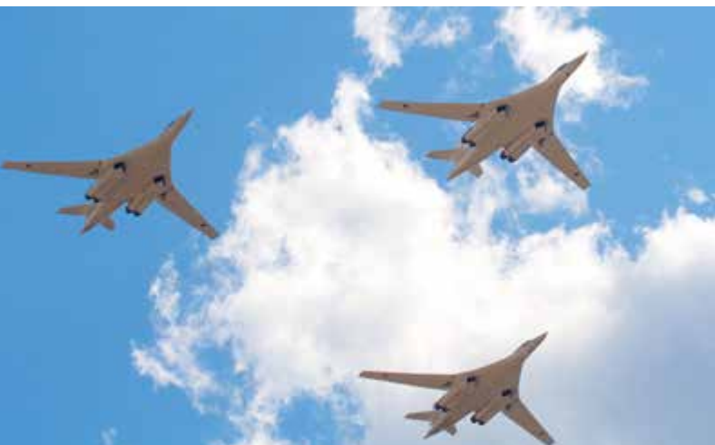
Russian Tupolev Tu-160 strategic bombers fly over Moscow. The United States and Russia together control about 90 percent of the world's nuclear weapons. (Andrey Belenko)

Severely strained relations between the United States and Russia – nations that together possess some 90 percent of the world's nuclear weapons – pose a number of specific risks. First, with increased tensions comes a heightened probability of crisis and conflict over regional disputes, including both NATO and non-NATO countries in Europe, and Syria in the Middle East. In addition, non-regional disputes could escalate, such as tit-for-tat responses to cyber-intrusions and mutual perceptions of domestic meddling by the other side.