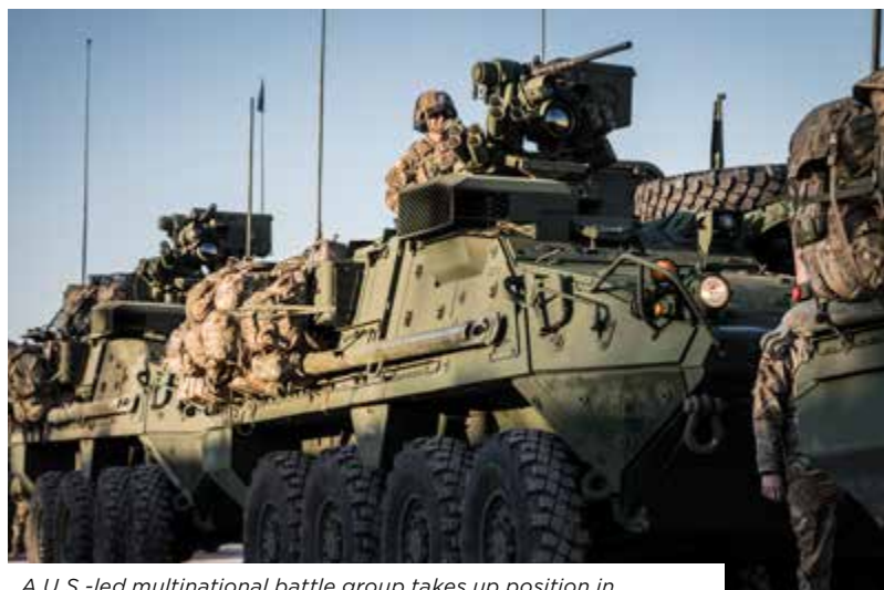
A U.S.-led multinational battle group takes up position in Poland as part of NATO's Enhanced Forward Presence. A total of four multinational battle groups are stationed in Estonia, Latvia, Lithuania, and Poland, on a rotational basis, to fortify the Alliance's eastern border.

U.S. concerns about Russia are not limited to military threats in Europe and the North Atlantic. Many Americans expressed deep concern at Russian interference in the 2016 U.S. presidential election. The hacker (or group of hackers) called Guccifer 2.0 penetrated the Democratic National Committee and Democratic Congressional Campaign Committee, releasing troves of emails through WikiLeaks. Though the Russian government strongly denied responsibility for these hacks, the U.S. intelligence community has stated that it "is confident that the Russian Government directed the recent compromises of e-mails from U.S. persons and institutions, including from U.S. political organizations." 34 Putin has recently acknowledged that the hacks may have been the work of patriotic Russians unaffiliated with the Kremlin. 35 In addition to Russian cyber-intrusions and the dissemination of stolen