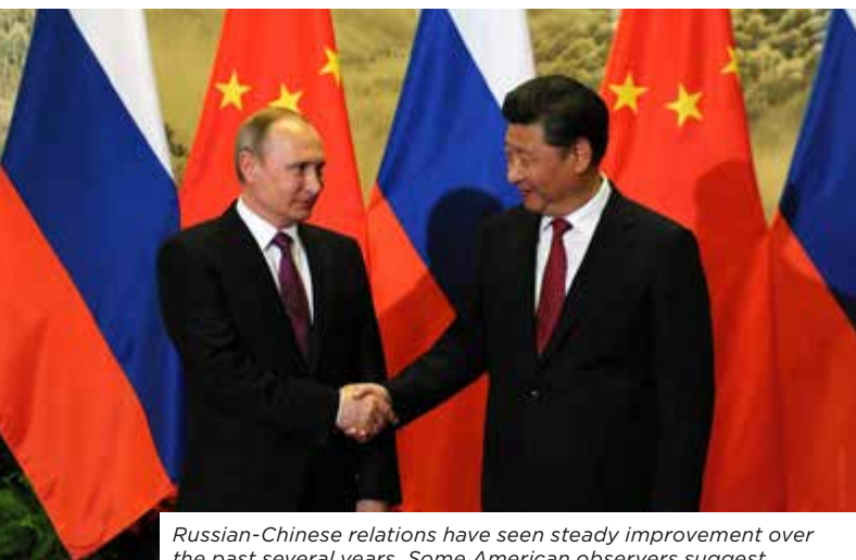
Russian-Chinese relations have seen steady improvement over the past several years. Some American observers suggest that U.S.-Russian rapprochement could help to drive a wedge between Beijing and Moscow.

Russia’s seizure of Crimea and support for separatist forces in Ukraine, nuclear saber-rattling, and increasingly bellicose rhetoric and menacing behavior regarding its former possessions to the west and south have persuaded many in the region and beyond that Moscow is prepared to employ force to pursue its strategic objectives. The weight of this assessment is bolstered by Moscow’s invasion of Georgia and occupation of its territories, the seizure and annexation of Crimea, the deployment of Russian conventional forces into eastern Ukraine, the military’s shelling of Ukrainian positions from the Russian side of the border, the extensive employment of Russian-aligned hybrid elements (such