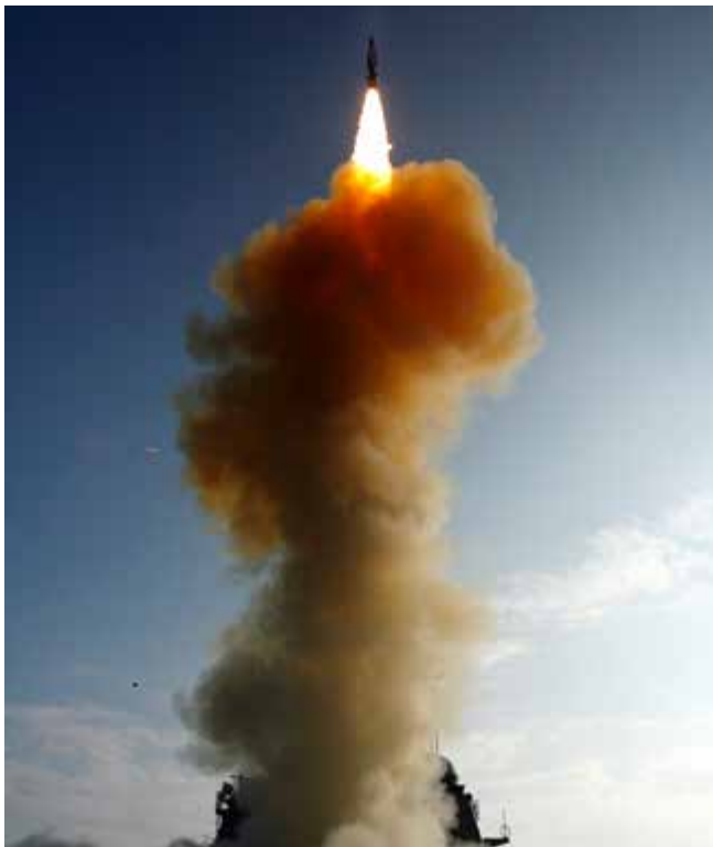
The United States used an SM-3 theater missile interceptor to destroy an errant American satellite during Operation Burnt Frost in 2008. The Russian Federation has tested its own anti-satellite weapons as well.

As was the case in the Cold War, the most plausible scenario for U.S. and Russian military forces to engage in large-scale combat is in Europe. It is worth considering first how even a very limited attack or incident could set both sides on a slippery slope to rapid escalation. If armed conflict looks at all likely, both sides would have overwhelming incentives to go early with offensive cyber and counter-space capabilities to negate the other side's military capabilities or advantages. If these early cyber and space attacks succeed, it could result in huge military and coercive advantage for the attacker – with few or even no direct casualties. It may appear very unlikely that the attacked side would retaliate strongly in response to some damaged computers and some malfunctioning