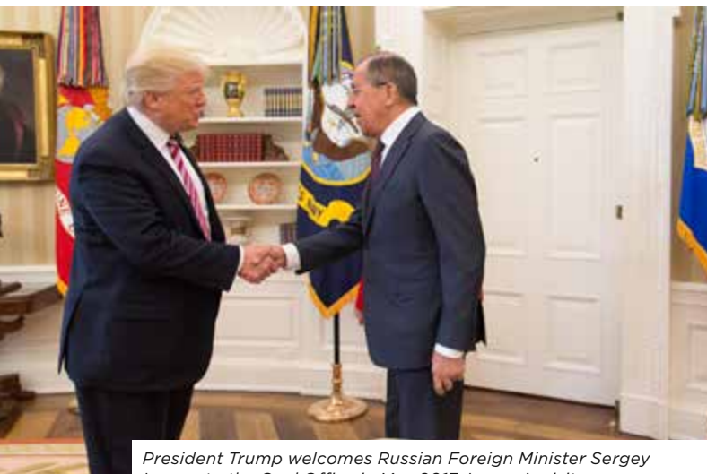
President Trump welcomes Russian Foreign Minister Sergey Lavrov to the Oval Office in May 2017. Lavrov's visit was seen by many as a sign of warming relations between the Trump administration and its Russian counterpart.

President Putin initially welcomed Trump's election, characterizing him as a "smart man" and saying that Russia was "ready to cooperate with the new American administration." 37 Putin's remarks reflected a broader sentiment among senior Russian officials who welcomed Trump's surprise election and described him, in a not-so-subtle contrast with both President Obama and candidate Clinton, as someone with whom they could do business. In the waning days of his presidency, Obama expelled 35 Russian diplomats suspected of spying, in retaliation for Russian attempts to disrupt the 2016 election. Though Moscow was widely expected to retaliate in kind, Putin refrained, dismissing Obama's action as irrelevant to the possibilities inherent in the era that would begin after a new president took office.