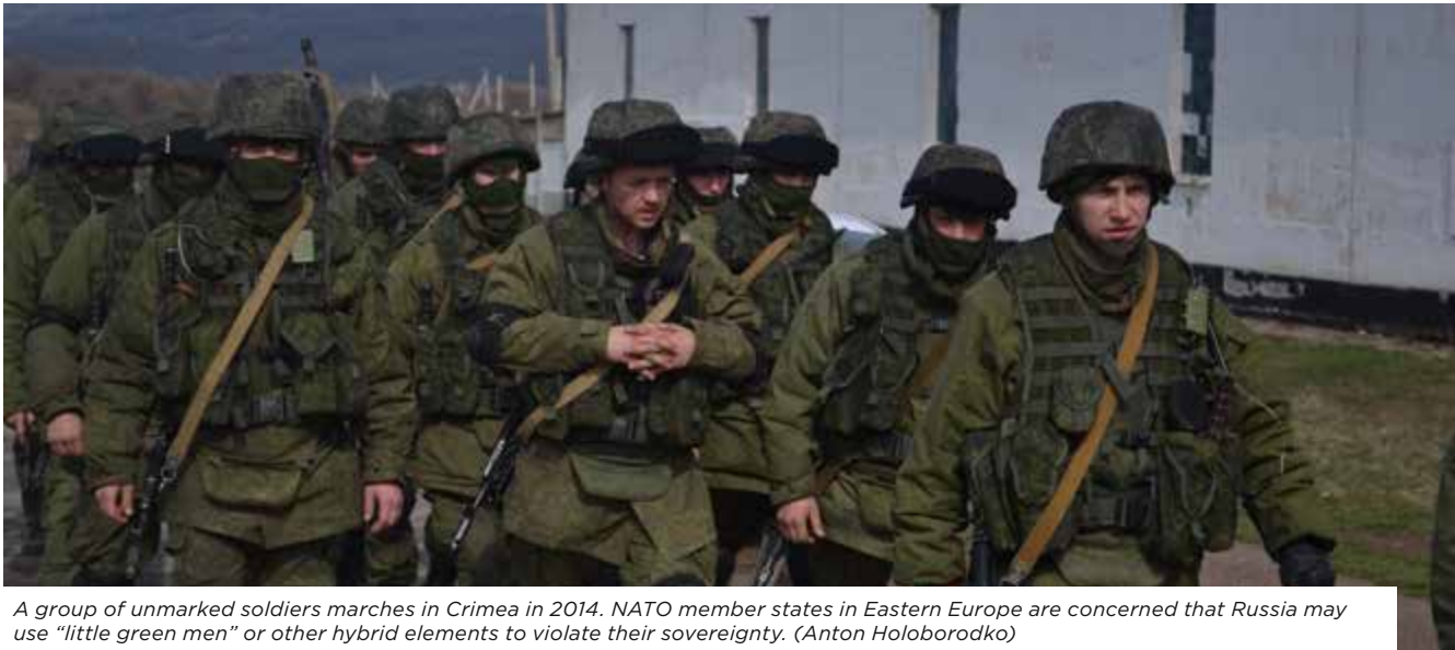
A group of unmarked soldiers marches in Crimea in 2014. NATO member states in Eastern Europe are concerned that Russia may use “little green men” or other hybrid elements to violate their sovereignty.