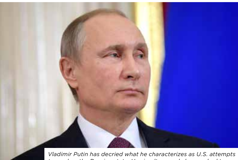
Vladimir Putin has decried what he characterizes as U.S. attempts to weaken the Russian state. He simultaneously has worked to strengthen Russia's political-military position to counter the perceived American threat.

The view among most policymakers and experts in Washington and Europe has been, unsurprisingly, quite different from the one widely held in Moscow. From the perspective of most in Washington, Moscow appears to be focused on restoring not only the power of the Russian military, but also the nation's influence in its traditional areas of influence or dominance. 26 The Russian leadership seems determined to regain some degree of suzerainty in its self-declared "near abroad," and seeks a buffer zone of compliant or client states to block the further expansion of European political institutions and NATO. Most Western governments characterize Russia as a revanchist power, unsatisfied with the current political-strategic status quo in its "near abroad," and desirous of a traditional sphere of power at a time when most in the United States and Europe reject such a model of international order. 27 They accuse it of violating