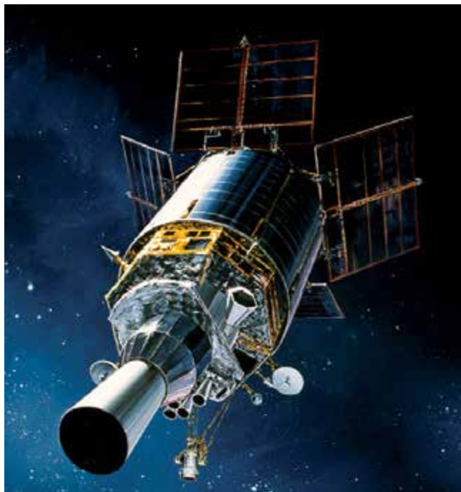
The United States relies on space-based assets such as the Defense Support Program satellite, depicted here, for nuclear early warning and command and control. Russia – and the United States, for that matter – may be faced with strong incentives to strike enemy satellites early in a crisis or conflict.

Other technological developments will increase first-mover incentives as well. This will particularly be the case with respect to cyber and counter-space capabilities, which are often more fragile and fleeting – and also of great importance to prevailing on the modern battlefield, especially for the United States. The United States relies on space for the full range of its military functions; thus, early disruption of such systems would be highly lucrative for Russia. Yet the disruption of some space-based systems could impede early warning of attack and communications from the National Command Authority to strategic forces. Meanwhile, cyber capabilities that may be fleeting in value could be used to interrupt the flow of forces and command, control, and communications among deployed forces. Yet, as former Secretary of the Navy Richard Danzig has noted, for example, cyber intrusions into nuclear or nuclear-related systems including command and control could send deeply destabilizing signals. 69