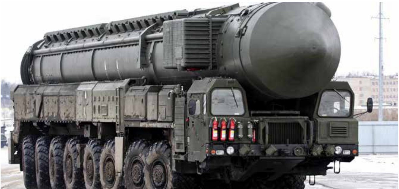
The Russian Federation uses highly survivable mobile ICBMs to assure its own nuclear second-strike capability. Emerging autonomous military systems, however, may allow Russia's adversaries to more reliably find, track, and target these systems, thereby endangering their deterrent effect.

How Changing Geopolitics and Emerging Technologies are Reshaping Pathways to Crisis and Conflict