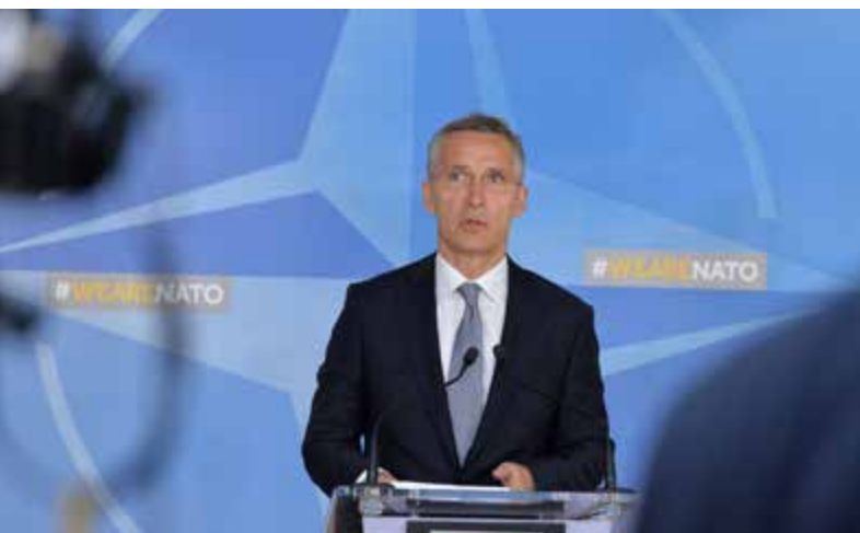
NATO Secretary General Jens Stoltenberg has been a vocal proponent of enhanced deterrent and defensive measures to protect the Alliance's eastern flank, even as he has supported calls for NATO-Russian dialogue.

international law and long-standing norms by committing armed aggression against Ukraine, changing borders in Europe through violence, violating arms control obligations, and seeking to undermine democratic elections and systems across the West.