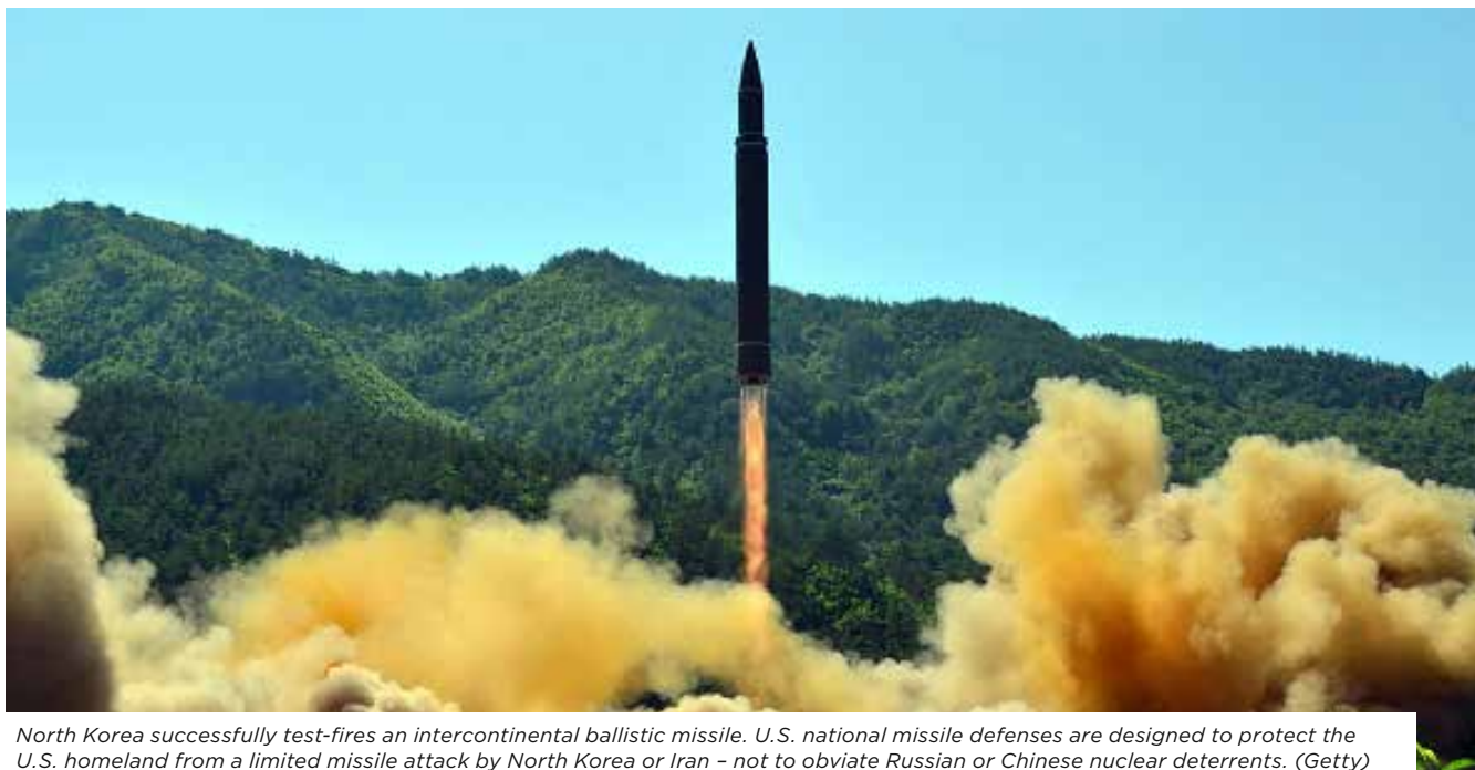
North Korea successfully test-fires an intercontinental ballistic missile. U.S. national missile defenses are designed to protect the U.S. homeland from a limited missile attack by North Korea or Iran – not to obviate Russian or Chinese nuclear deterrents.

able to conduct a devastating nuclear attack, including in a second strike. The United States has no national air defense system against bombers and cruise missiles, and its national missile defense system has only 44 interceptors, far too few to negate a Russian second strike that could include many hundreds of missile warheads and bombs. Moreover, U.S. national missile defenses are oriented against North Korea and as a hedge against future Iranian capabilities, and so are likely in any event to be incapable of intercepting Russian warheads with advanced countermeasures.